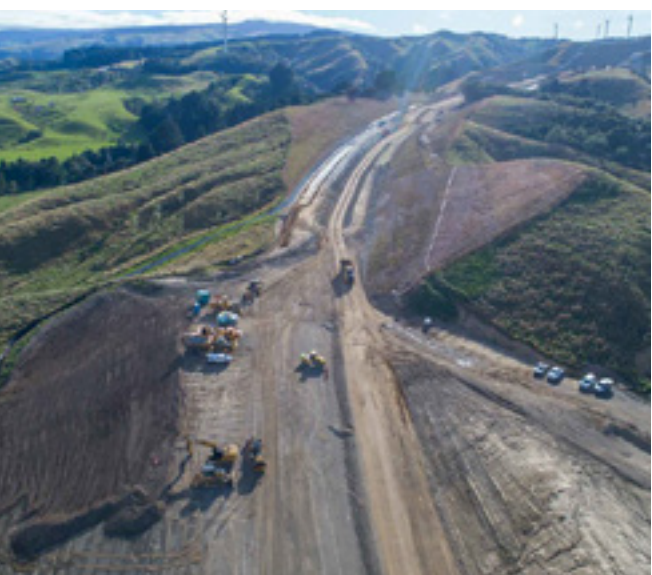
PHOTOS ABOVE: Te Ahu a Turanga - Manawatū Tararua Highway currently under construction, which will replace the vulnerable Manawatū Gorge road.

The call: Improving the resilience of our road network needs to become an urgent ongoing priority. This means having a clear and fully-funded plan for improving the resilience of major roads most at risk or where the consequences of a road being impassable are most significant. It also means carefully considering opportunities to improve resilience when planning road construction, renewals and maintenance work.