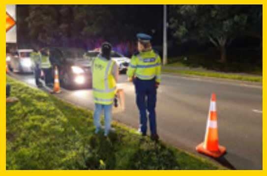
PHOTO ABOVE: Students involved in Kaitiaki o Ara/Students Against Dangerous Driving join a Police drink driving checkpoint.

The call: Saliva-based roadside drug testing devices need to be introduced as soon as possible by Police and alcohol testing numbers need to return to their previous high levels. Authorities need to monitor and follow up those who do not install an interlock so that all drivers sentenced to them actually end up with a device in their vehicle.