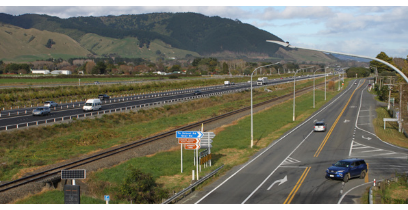
The contrast in safety engineering between the old SH1 north of Wellington (on the right) and new Peka Peka to Ōtaki expressway is stark.

The problem: Old highways, on which traffic volume has grown considerably in recent decades, are not as safe as new roads.